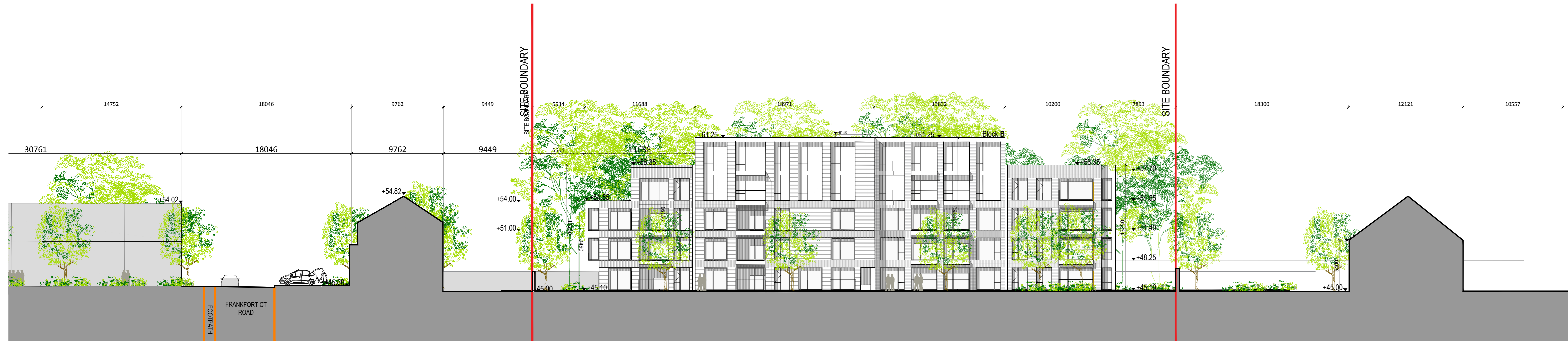
Site Elevation E-E ESC 1:200