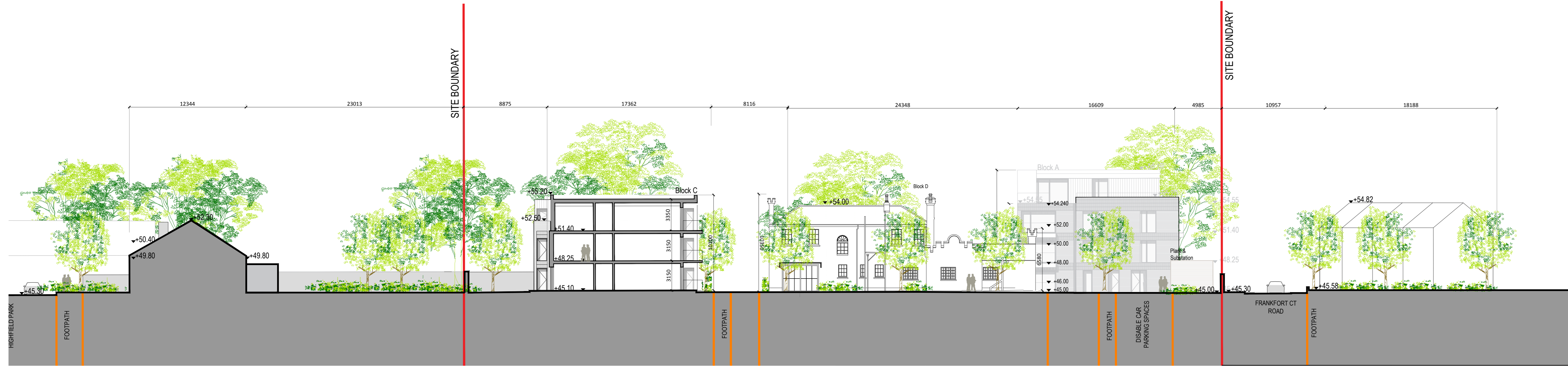
Site Elevation D-D ESC 1:200